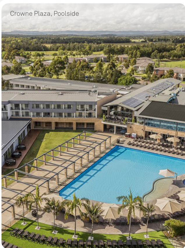
Crowne Plaza, Poolside