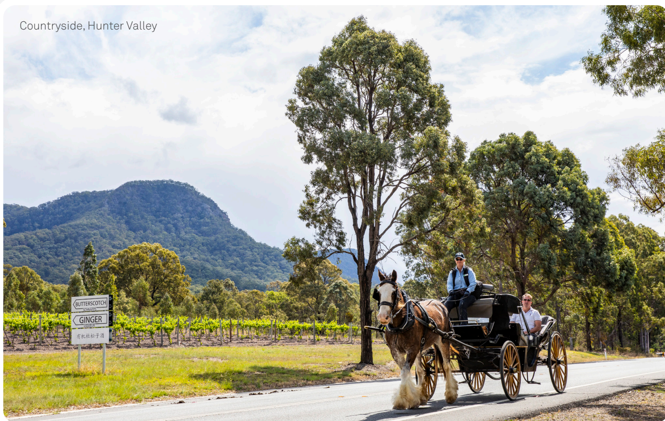
Countryside, Hunter Valley