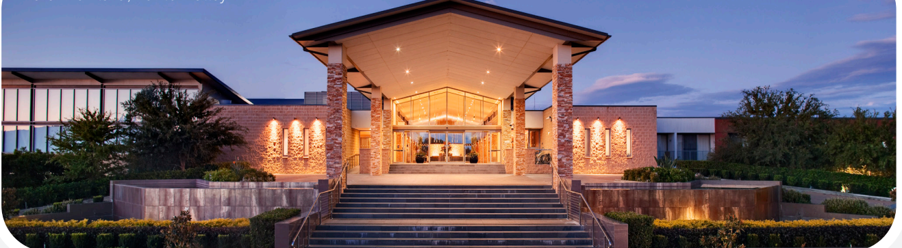
Crowne Plaza, Hunter Valley

If you are posting about the LGNSW Annual Conference on social media, please use the hashtag #lgnsw2020 .