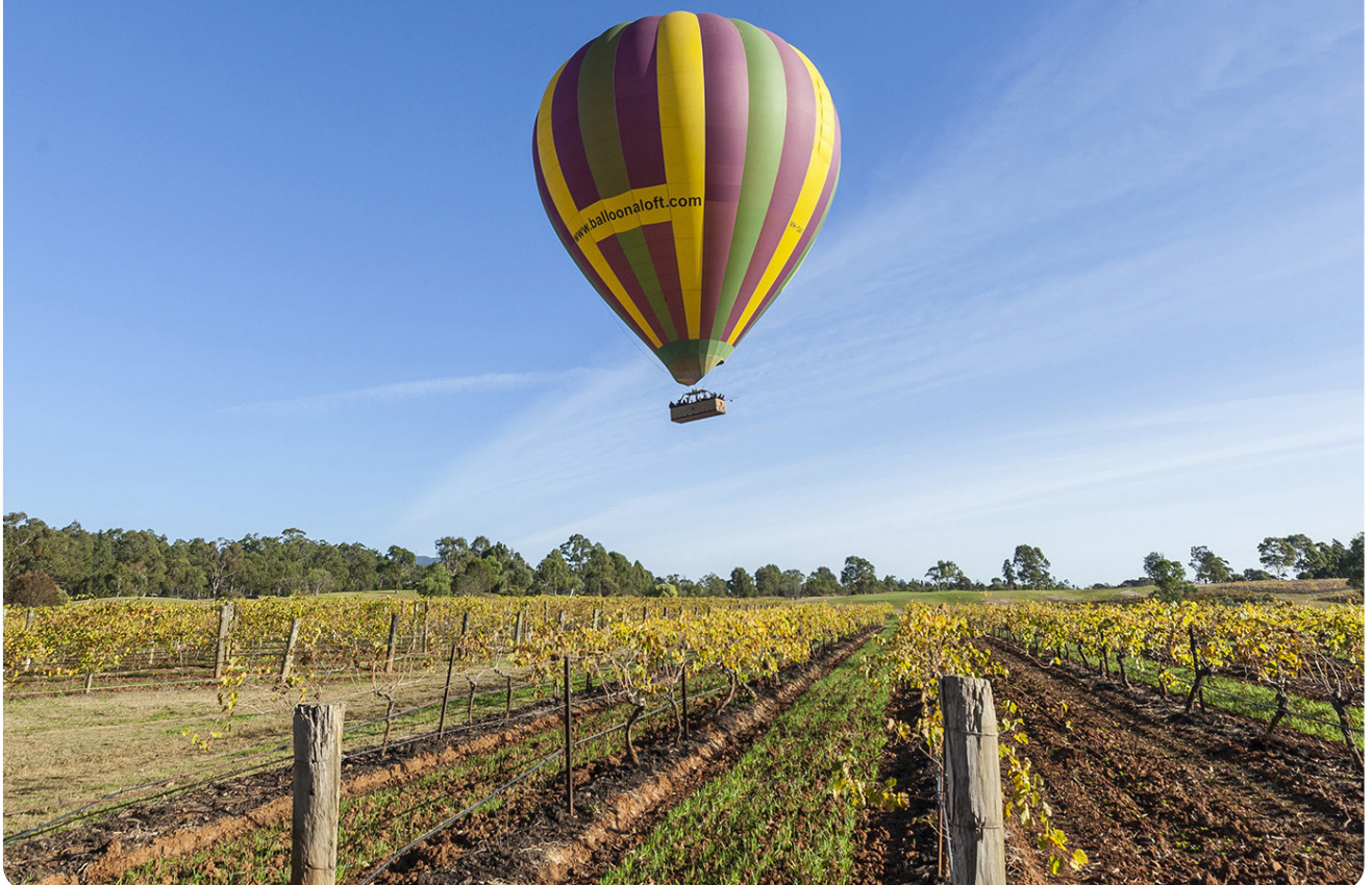
Ballooning, Hunter Valley

For privacy-related enquiries please contact us on 02 9242 4000, email lgnsw@lgnsw.org.au or post to GPO Box 7003, Sydney NSW 2001.