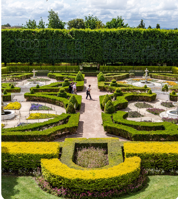
Hunter Valley Gardens, Pokolbin

The AR Bluett Memorial Trustees will also present the prestigious AR Bluett Awards during the business program to councils that have been recognised as the most progressive in NSW in 2019/20. Widely acknowledged as the greatest accolade a council can achieve, this will be the 76th year for which the awards have been presented. Award recipients will need to register for the Ministers Forum and Welcome Reception and purchase a ticket.